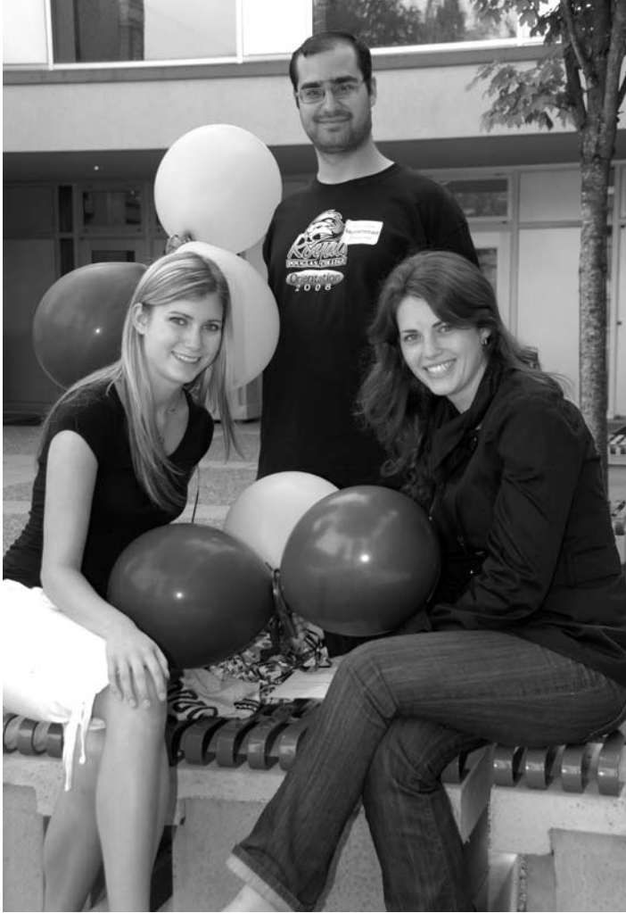
Volunteers and new students helped make Summer orientation events at both College campuses successful.

The Office for New Students (ONS) is thrilled to have doubled attendance in their late-Summer orientation events.