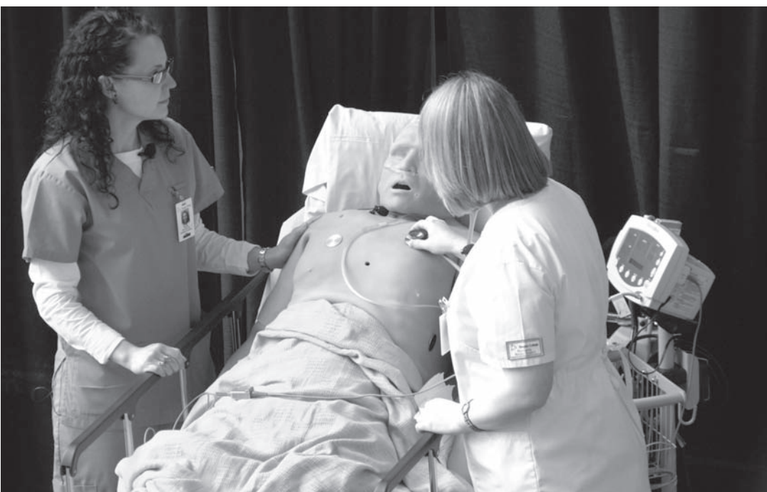
Health Sciences students care for I-Stan in the Atrium of the Health Sciences Centre.