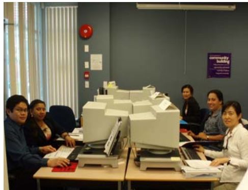
Participants of the Operations Division

Way of the World Travel and Cruises (WWTC) is the Practice Firm, which simulates a full cycle business and full cycle accounting transactions with other Practice Firms all over the world.