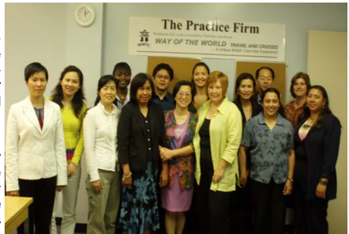
Coordinators and participants of the Practice Firm

With more than 150 people that have participated in the Practice Firm, 89% of the graduates are employed. With many participants coming from an accounting background, a key aspect is doing business in the latest version of Simply Accounting software.