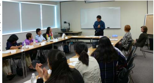
Toastmasters session at the Practice Firm

This self-paced program is part of professional development targeted to encourage participants from all backgrounds to speak effectively in public and at work, communicate better amongst their co-workers, listen effectively and express themselves easily, especially at interviews.