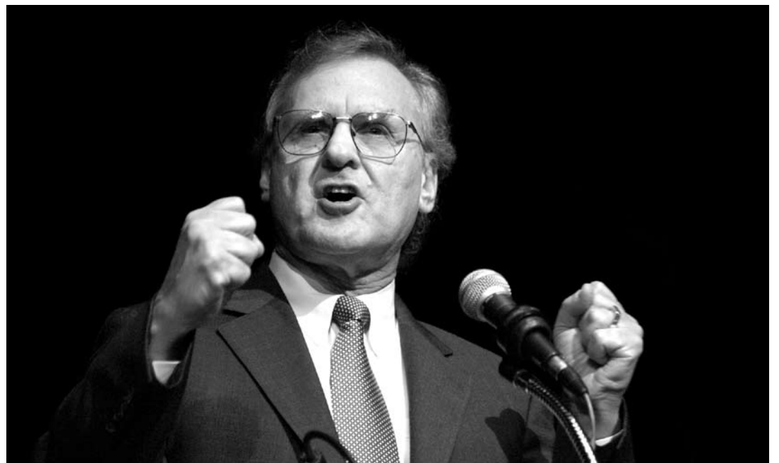
The Community Social Service Worker program presents Stephen Lewis on Thursday, March 22.

This event is sponsored by HSBC, Fraser Health and Douglas College. For more information visit www.douglascollege.ca/stephen-lewis ; for tickets, call Ticketmaster at 604-280-4444.