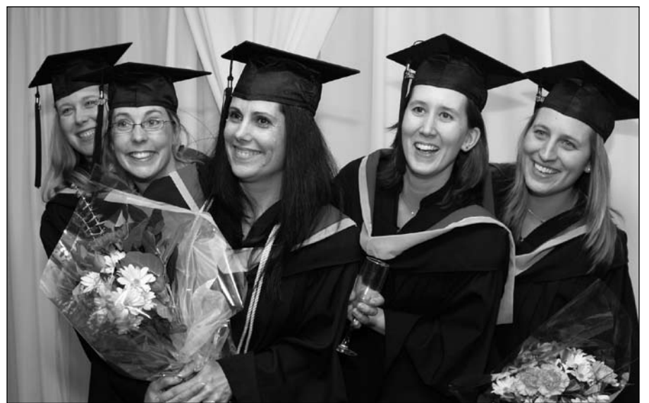
Bachelor of Science in Nursing grads.